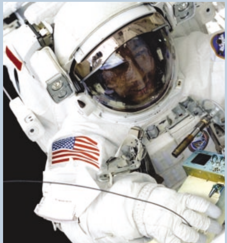
Trace Gas Analyzer (TGA) in use during a space walk, in an artist's depiction. The TGA uses a miniature quadrupole mass spectrometer to seek tiny leaks external to the space station. The TGA is currently stored aboard the space station and available for use.

The miniature mass spectrometer, named the Trace Gas Analyzer (TGA), was built by Chutjian and his colleagues at JPL and at Oceanering Space Systems in Houston. It was delivered to the International Space Station (ISS) in February 2001. Its primary use aboard the ISS is to detect leaks of ammonia and rocket propel-